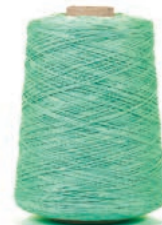
3. the fabric is dyed while being spun