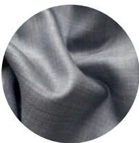
4. R-PET fabric