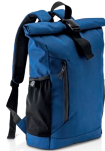
OCEAN • ROLL DM24113