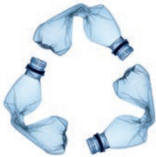
1. PET bottles