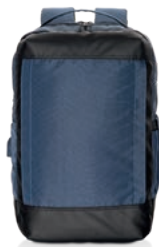
5. finished product