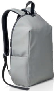
BRERA • BPK DM20112