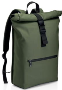
BRERA • ROLL DM22126