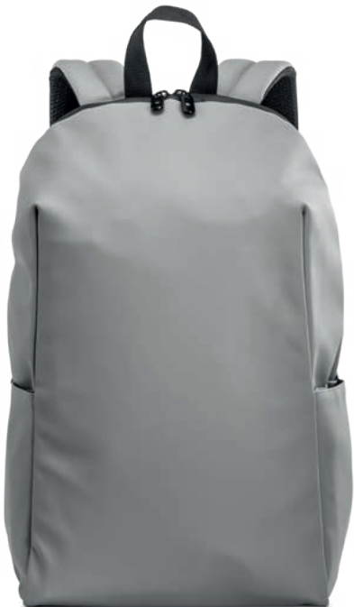
Rear anti-theft pocket