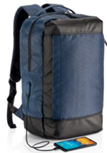
ECO-DYED Biz DM23112