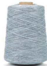
3. the semi-finished pro- duct is spun