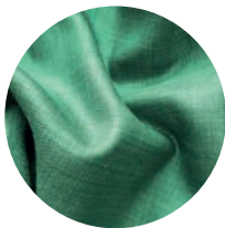
4. R-PET ECO DYED fabric