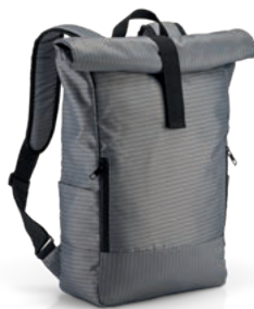
ECO-DYED Roll DM23110