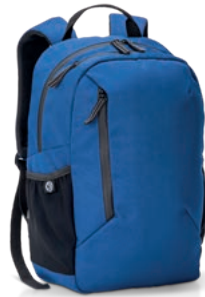
OCEAN • BPK DM24101