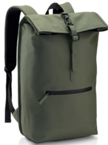
BRERA • RECYCLED DM24111