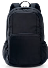
5. finished product