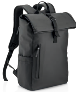
BRERA • DELUXE DM24109