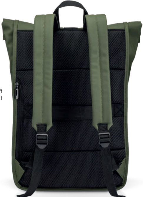
Rear anti-theft pocket