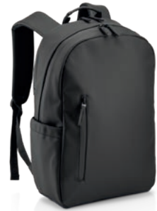
BRERA • CEO DM24110